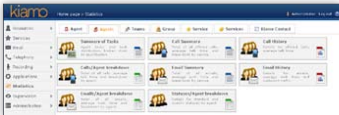
Varied, detailed statistical reports.

Various detailed reports (sorted by agent, list of agents, group of agents, service or list of services) can be accessed through the web interface, or exported in Excel format.